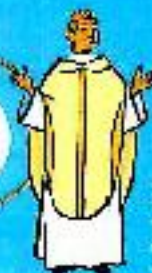
On Holy Thursday, the priest wears white vestments.

O n Holy Thursday, Christians remember the final meal that Jesus had with his disciples, the Last Supper. He washed their feet as a sign of love and of service. He gave them the Eucharist to nourish them with his Body and his Blood.