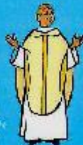
On Easter Sunday, the priest wears white vestments.

O n Easter Sunday, the joy of the Resurrection gives rise to a great day. At Mass, Christians renew their Baptismal Promises and are sprinkled with the holy water blessed at the vigil. After the Mass, we celebrate by partaking of some of the treats we give up during Lent. The Easter Season lasts seven weeks, until Pentecost.