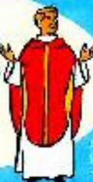
On Palm Sunday, the priest wears red vestments.

O n Palm Sunday, Christians begin Holy Week. It is the most important week of the year because it leads us right up to Easter Sunday. The Church invites us to follow Jesus through his Passion and all the way to his Resurrection.