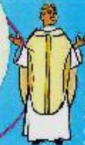
On Holy Saturday, the priest wears white vestments.

O n Easter Sunday, the joy of the Resurrection gives rise to a great day. At Mass, Christians renew their Baptismal Promises and are sprinkled with the holy water blessed at the vigil. After the Mass, we celebrate by partaking of some of the treats we give up during Lent. The Easter Season lasts seven weeks, until Pentecost.