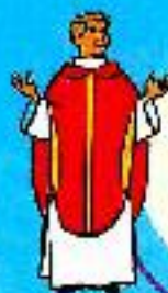
On Good Friday, the priest wears red vestments.

O n Good Friday, the Church celebrates the day when Jesus died on the cross. Mass is never celebrated on this day. Instead, Christians are encouraged to make the Stations of the Cross or to participate in the Celebration of the Lord's Passion. At the latter, the story of the Passion of Jesus is read from the Gospel of John. This is followed by the special prayers for the human race and then the Adoration of the Holy Cross and Holy Communion.