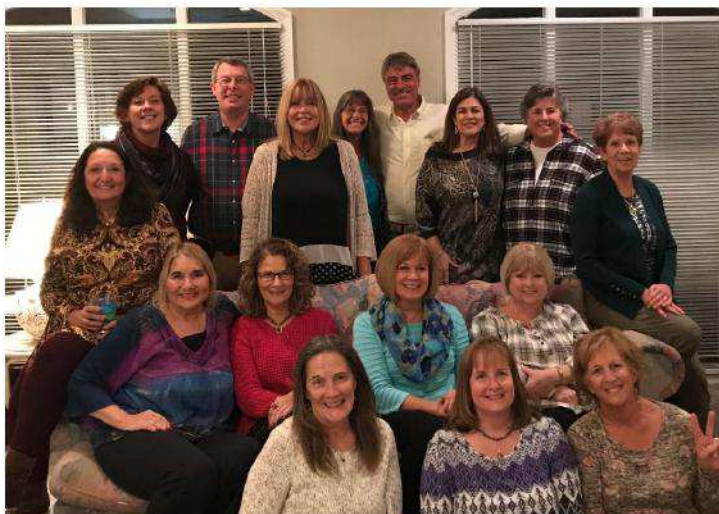
Our Lady of Victory Class of 1971 October 26, 2017