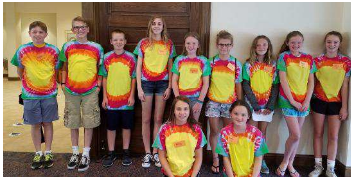
OLV Teens volunteer at Vacation Bible School