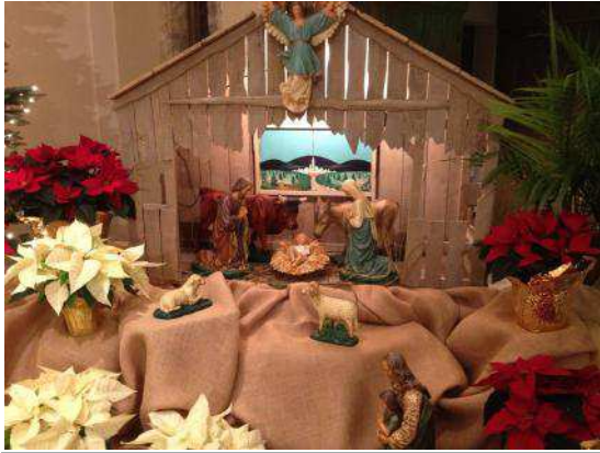
The Nativity Scene at Our Lady of Victory

The Stable: Most scholars believe the stable referred to in the Gospels was most likely a cave built into the rocks near the inn, which illustrates the divine truth that the Son of God came down to the very heart of the earth to dwell among humanity.